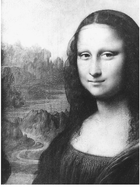
FIGURE 1. Leonardo da Vinci, "Mona Lisa" (detail) (1503).

buildings, or implements have a constant form, in contrast, mountains and rocks, trees and bamboos, running and rippled water, like mists and clouds, do not have a constant form, but preserve a constant inner principle (li). When a constant form is defectively portrayed, everyone perceives it; however, even a