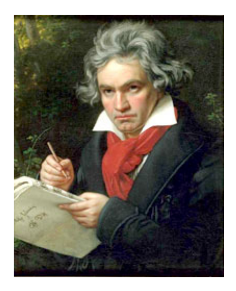
Ludwig van Beethoven.

Beethoven, an optimistic republican and militant of the American Revolution, could not but be charmed by this poetical material.